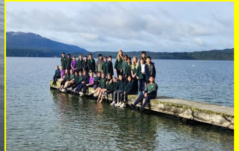
Kupe 7 enjoy sketching at Lake Tarawera!