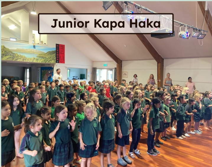
Junior Kapa Haka